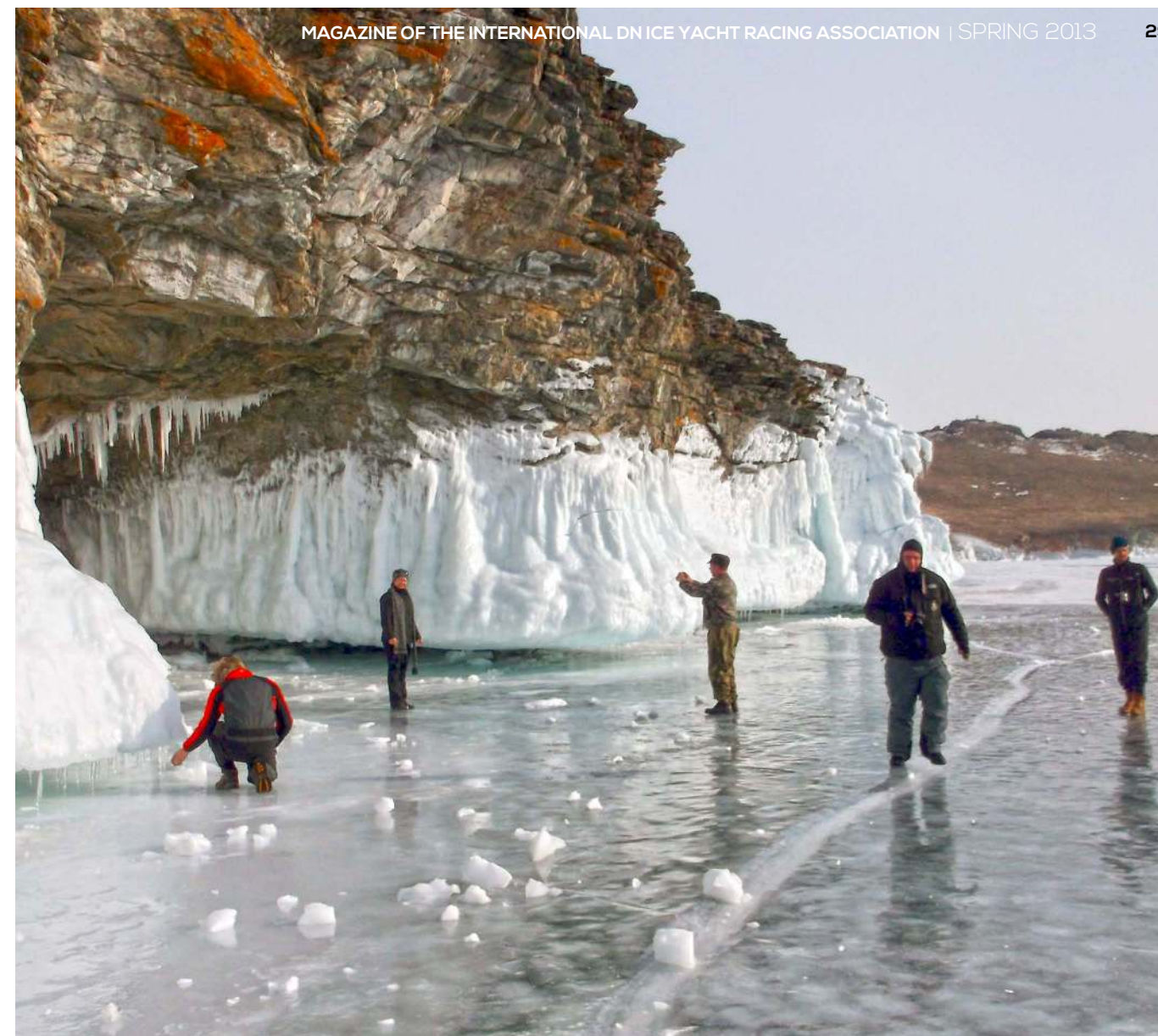
Visiting Baikal's ice caves via hovercraft tour that took us to the deepest part of the lake which is one mile deep.

A 27 foot high Buddhist stupa, considered to be offerings to deities, on the highest spot of Ogoy islet not far from the sailing area. This stupa is only one of two that exist in Russia and was built 2005.