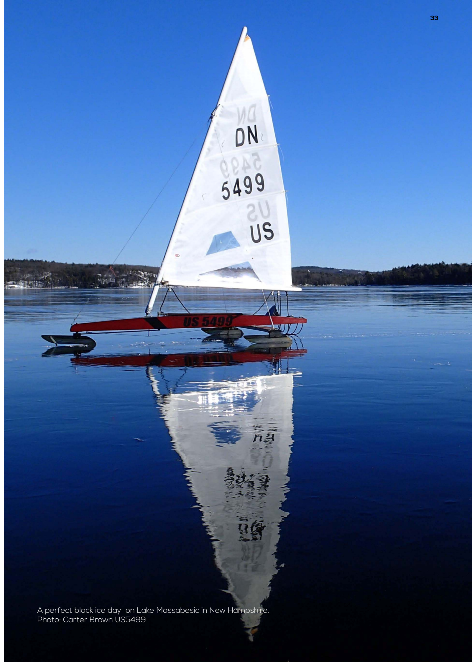
A perfect black ice day on Lake Massabesic in New Hampshire. Photo: Carter Brown US5499