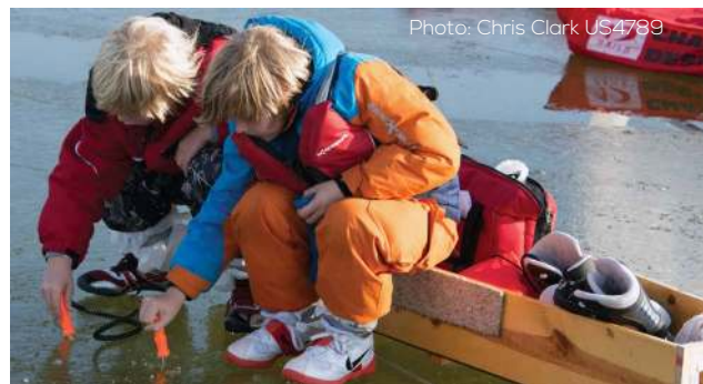
US4789