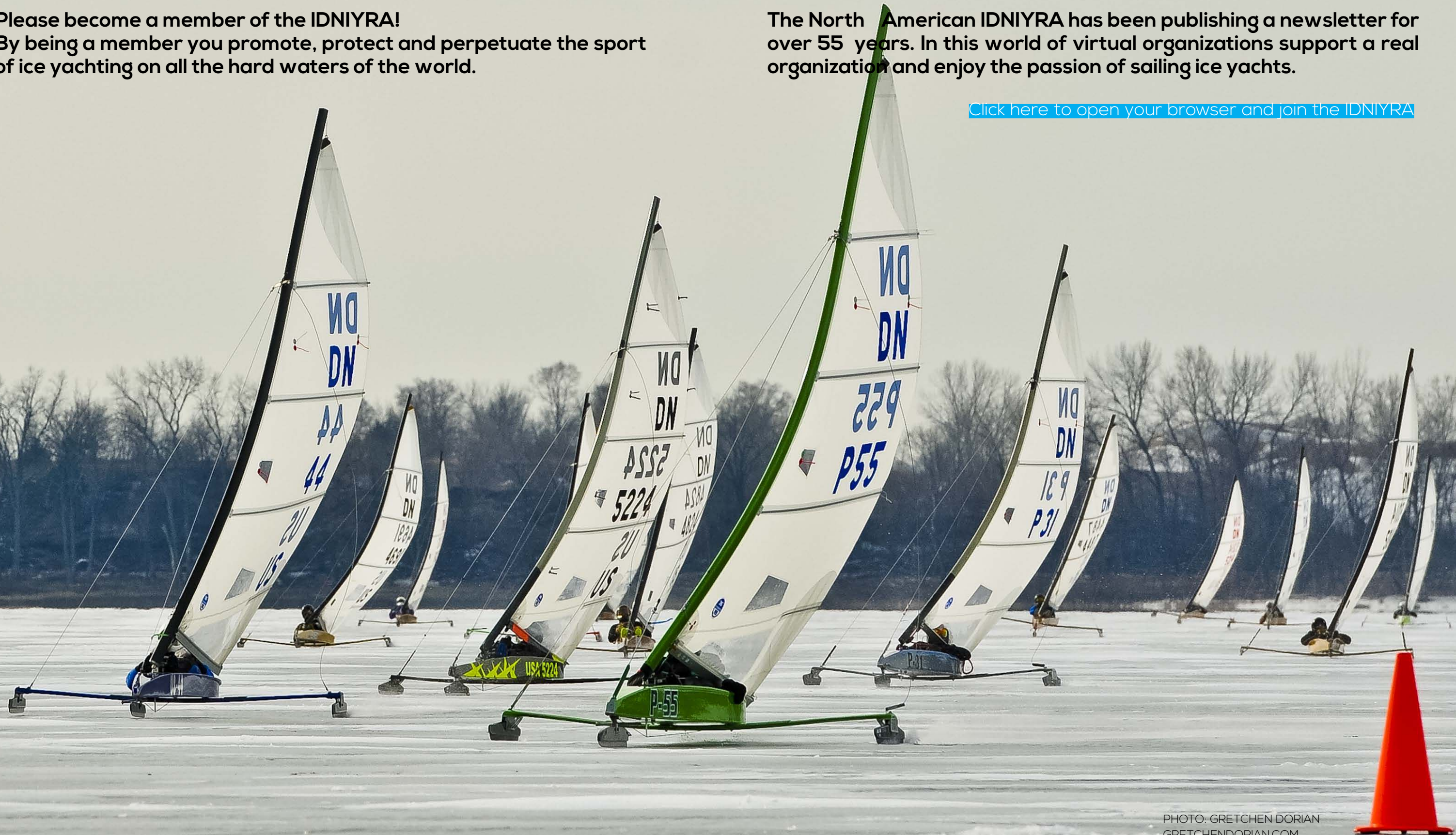
2011 GOLD CUP

Click here to open your browser and join the IDNIYRA