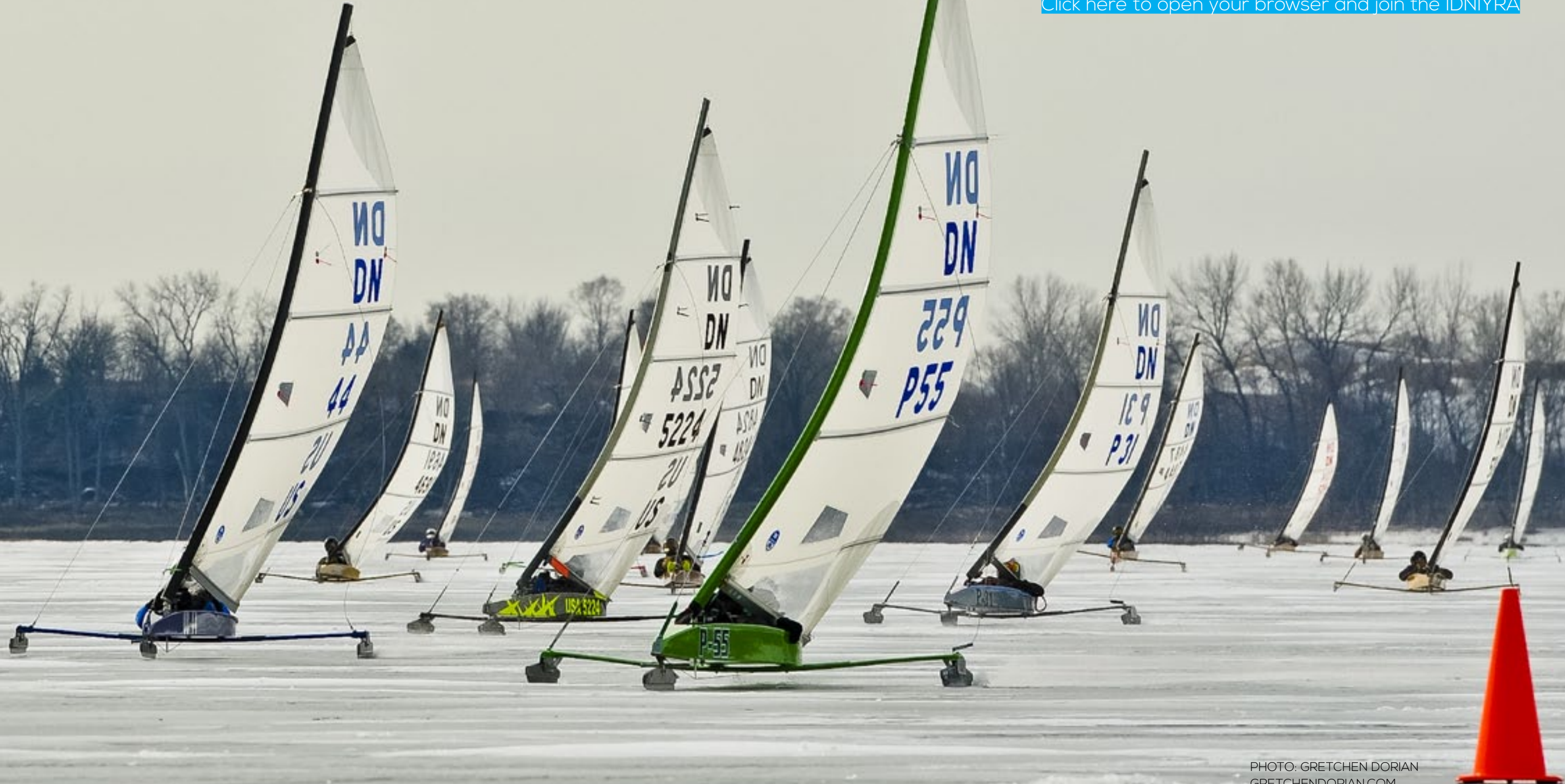
2011 GOLD CUP

Click here to open your browser and join the IDNIYRA